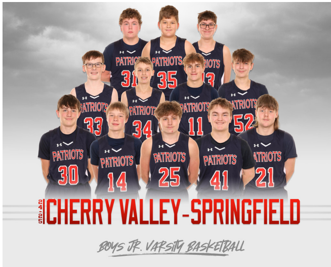
Boys Jr. Basketball