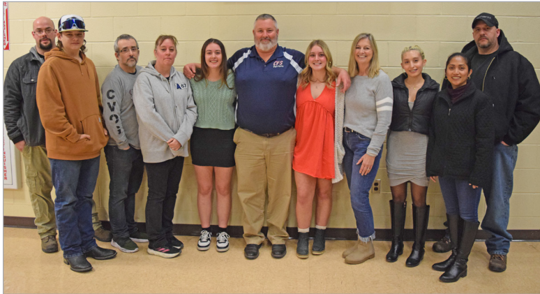
Varsity Girls Basketball: